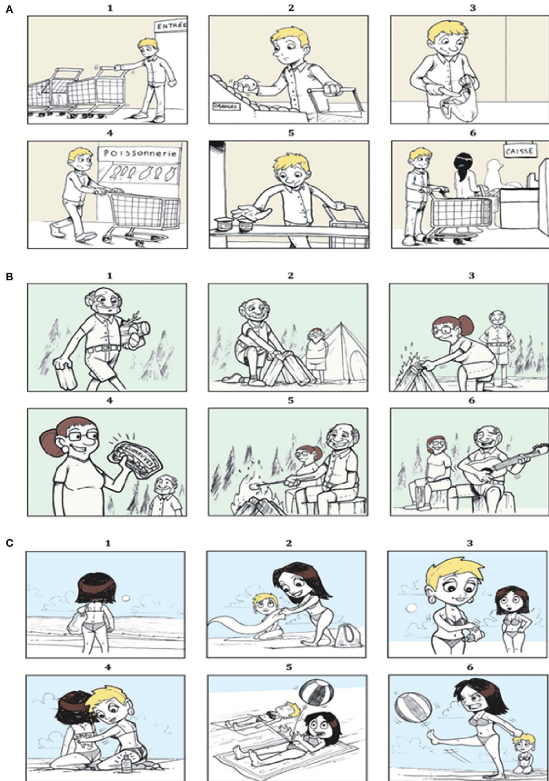
FIGURE 1 | Examples of story sequences used in the storytelling in sequence task. (A) Complexity level-1 sequence (low referential complexity); (B) Complexity level-2 sequence (intermediate referential complexity); (C) Complexity level-3 sequence (high referential complexity).