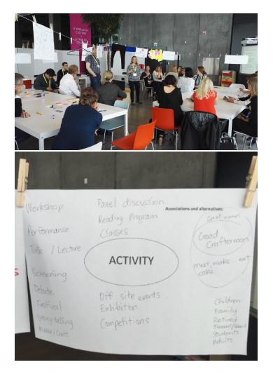
Figure 1: Place IT workshop exploring digital place and activity centric services.