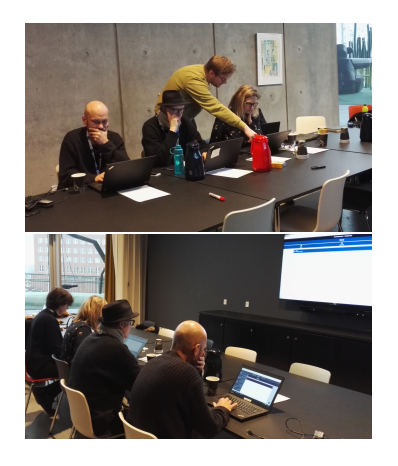
Figure 2: Participatory design workshop with the library staff.

Figure 1: Place IT workshop exploring digital place and activity centric services.