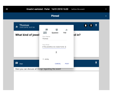
Figure 5: Example of activity sheet before activity: Creating post.