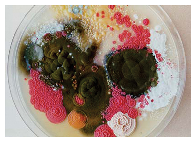
Fig. 1 Spontaneous development of pigmented microorganisms at the surface of nutritive agar Petri dish.

against the consumption of spoiled food. Colors of foods create physiological and psychological expectations and attitudes that are developed by experience, tradition, education, and environment: "We inevitably eat with our eyes."