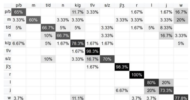
Figure 2: Consonants confusion matrix for the articulatory-to-acoustic (listening test).