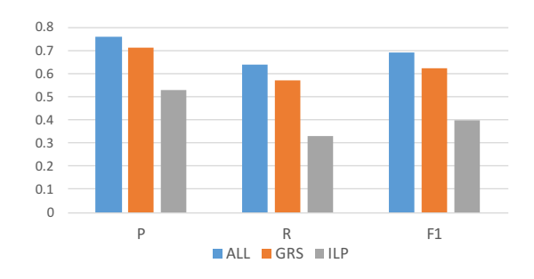
Figure 2: Feature ablation for the different feature groups.

It is interesting to note that for SORAL on average we miss 13% of aligned relations from the real coverage performance of SORAL when comparing the results with sampling and without. In terms of F1 measure we have only a small difference of 6%, which presents an optimal results when comparing the advantages we get in terms of efficiency through sampling.