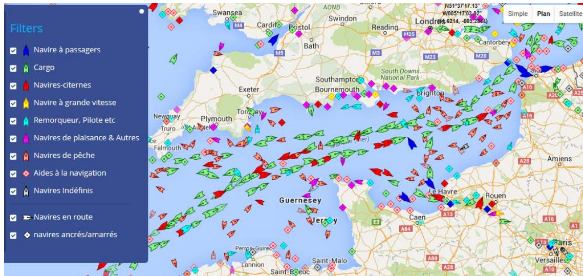
Figure 3 - Ships in the English Channel according to the Marine Traffic website (18 March 2016 / 14.45)