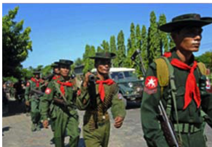
Burmese army troops in Kachin State. The Burmese army is increasing troops in ethnic areas.

The terrorising, controlling and shattering of communities resulting from sexual violence creates a long-term societal damage that fosters ethnic nationality populations' hatred for the Burman majority, the army and the government and threatens hopes of future national reconciliation.