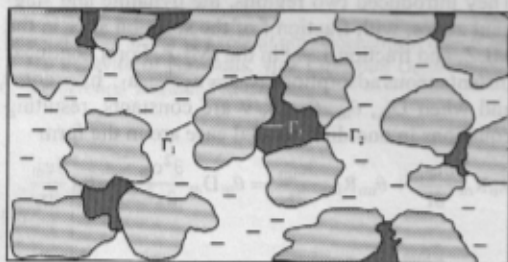
Figure 1. A porous medium with MLZ and IMLZ. pore volume occupied by mobile liquid ( \Omega_1 ), volume occupied by immobile liquid ( \Omega_2 ), solid volume ( \Omega_3 ).

We denote by \phi_1 the volume fraction of \Omega_1 , i.e. \phi_1 = \frac{|\Omega_1|}{|\Omega|} , and by analogy \phi_2 = \frac{|\Omega_2|}{|\Omega|} . Obviously,