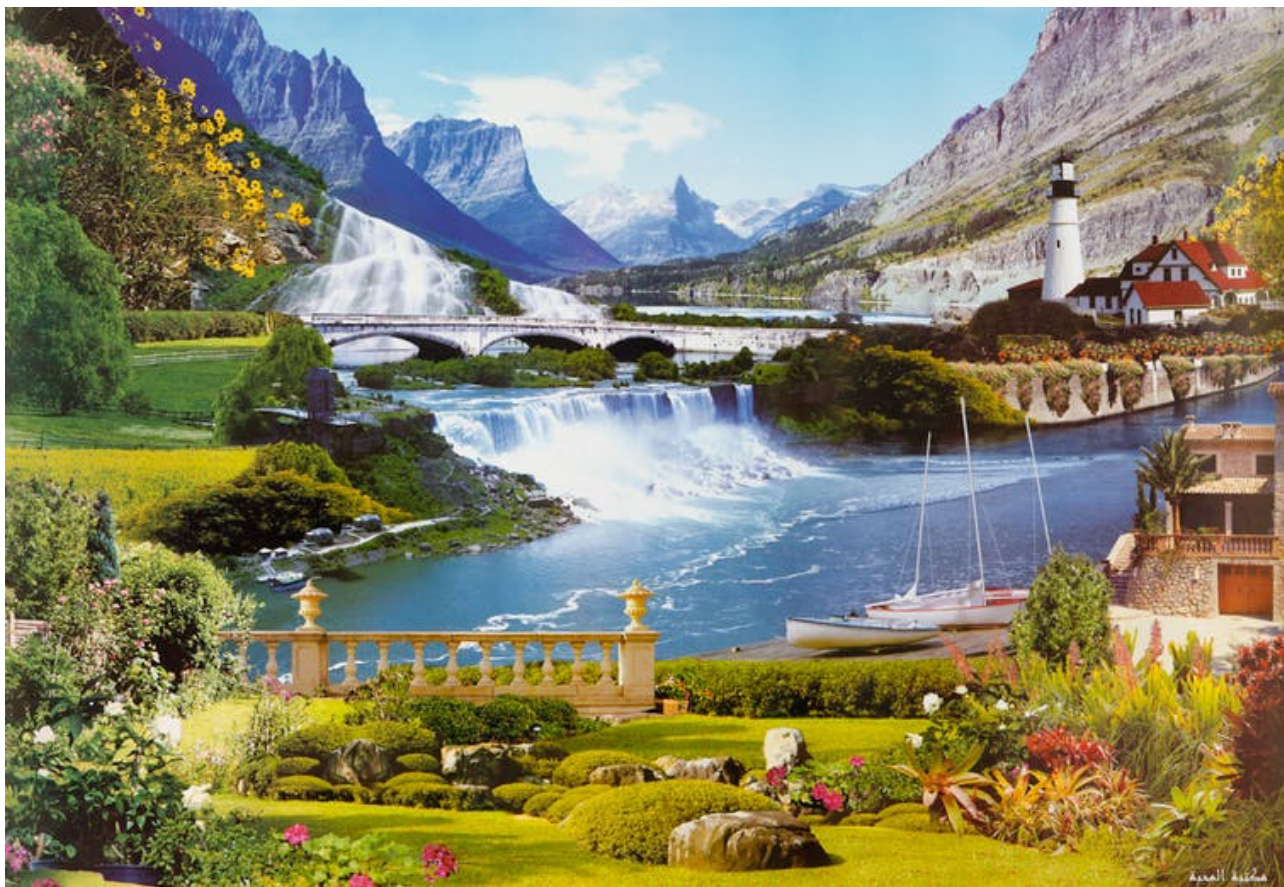
A lighthouse borrowed from Scandinavia enhances this 2009 poster. Maktaba al-Maḥaba/Vincent Battesti, Author provided

All the posters illustrating this article come from my 2009 fieldwork in Cairo, purchased for just a few Egyptian pounds (less than $US1). These idealised images are displayed across the country, in private indoor spaces, coffee shops, restaurants, hairdressers, and rural and urban areas, but are especially common in the arid Sinai countryside, Libyan desert and west Mediterranean coast.