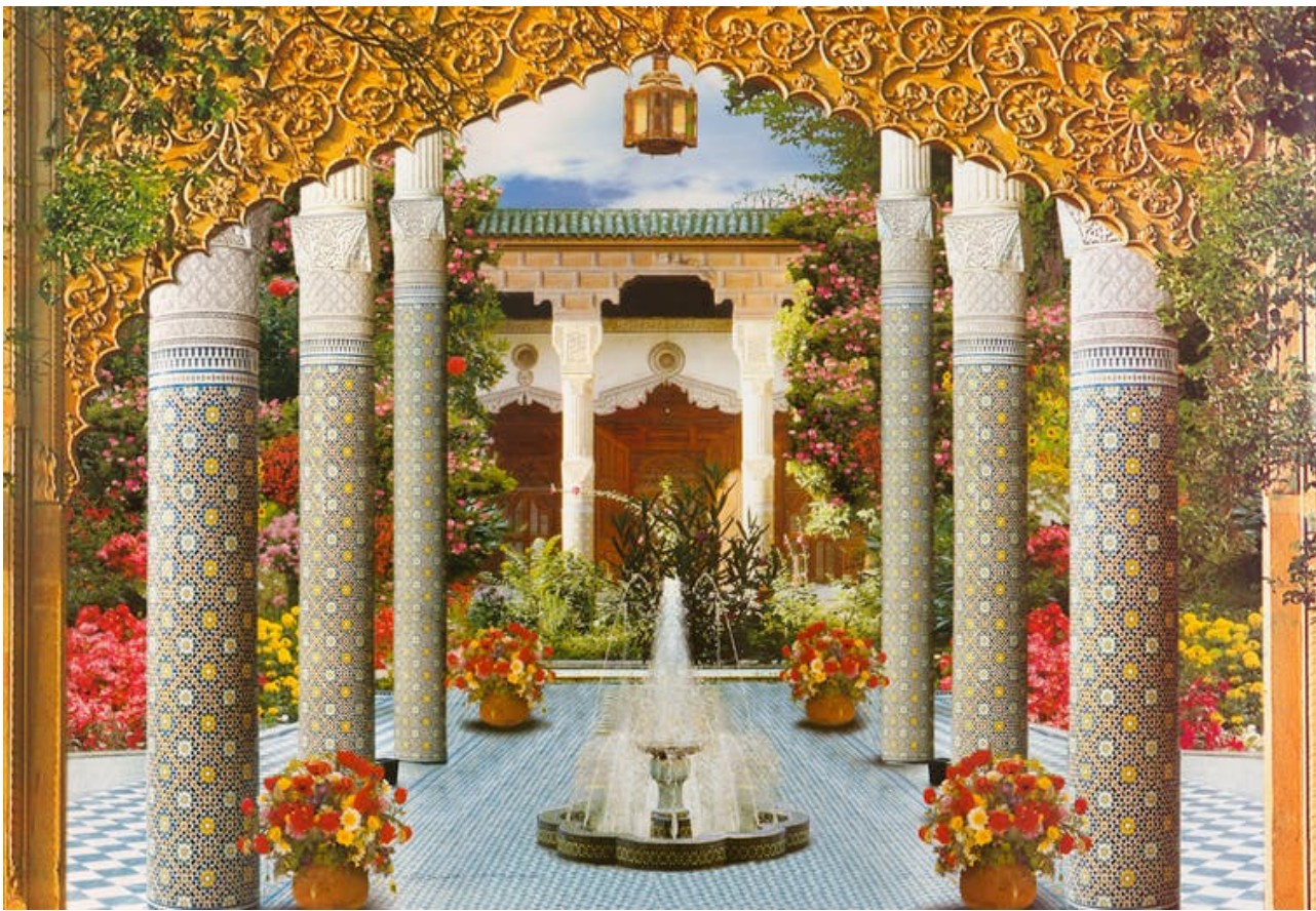
Fountains are recurrent elements of Egyptian posters.

What does this reveal about Egyptians' ideal of nature? In accumulating images from other eras and places, these posters create an exotic space located somewhere between the nostalgia for a lost Eden and the promise of Paradise. The inclusion of Islamic golden-age gardens, Swiss chalets and Atlantic lighthouses also reveals the attractiveness of a globalised world.