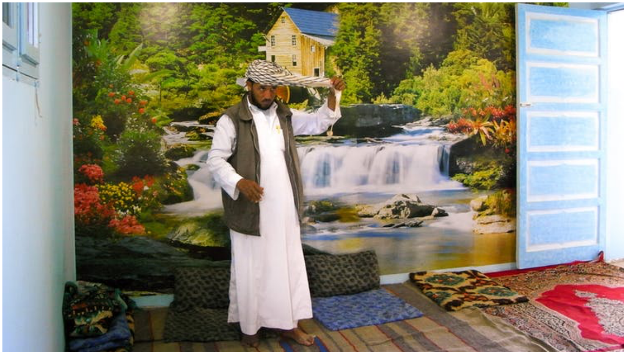
The living room interior in a newly built home in the Siwa Oasis of Egypt's Libyan Desert.

These posters are prominently displayed across Egypt, offering visual delight in gas stations and local eateries. In Siwa, a remote oasis in the Libyan desert of Egypt, I spotted them in the marbūea (living room) of houses.