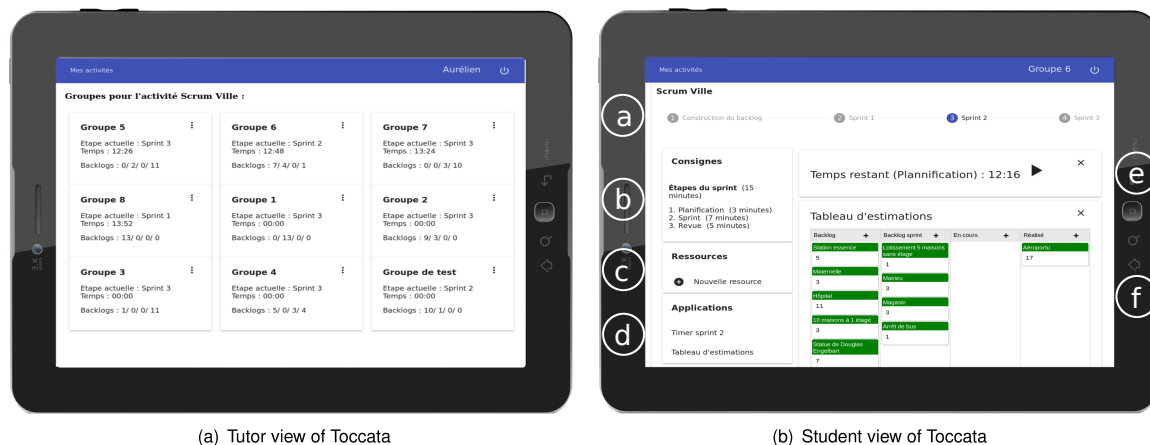
Figure 1: Toccata with the Scrumville activity loaded.

We developed Toccata to enable teachers to script digital activities, share them with students and teachers, and orchestrate them in the classroom. Activities can be scaffolded, and contain a sequence of sub-activities. Teachers define an activity by associating to it a set of instructions (Figure 1.b), resources (Figure 1.c) and applications (Figure 1.d). Teachers can embed any external web-based application. But Toccata also offers activity-enriched features to applications specifically developed for it. For instance a timer widget (Figure 1.e) for better awareness and better group management in a timed activity. Resources can be text (HTML), PDF, image, audio or video documents. Finally teachers can add students to the activity. The result is a collaborative activity with the a set of tools, resources and instructions for students in the activity. Sub-activities can be re-defined to offer other applications, resources, instructions and participants.