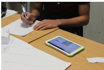
Figure 4: Student using Toccata beside paper-and-pencil

Before a class, teachers can create student groups by duplicating an activity and sharing the copies with different groups. All the activities share the same template but are independent. In class, either the teacher or the students can load the relevant activity on the tablets.