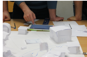
Figure 3: Toccata used during a construction step to pick tasks