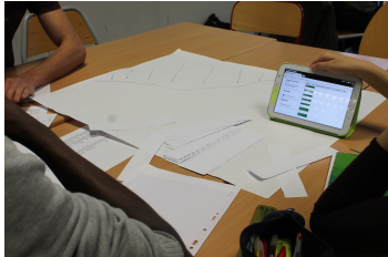
Figure 2: Toccata used to show and discuss tasks to be done