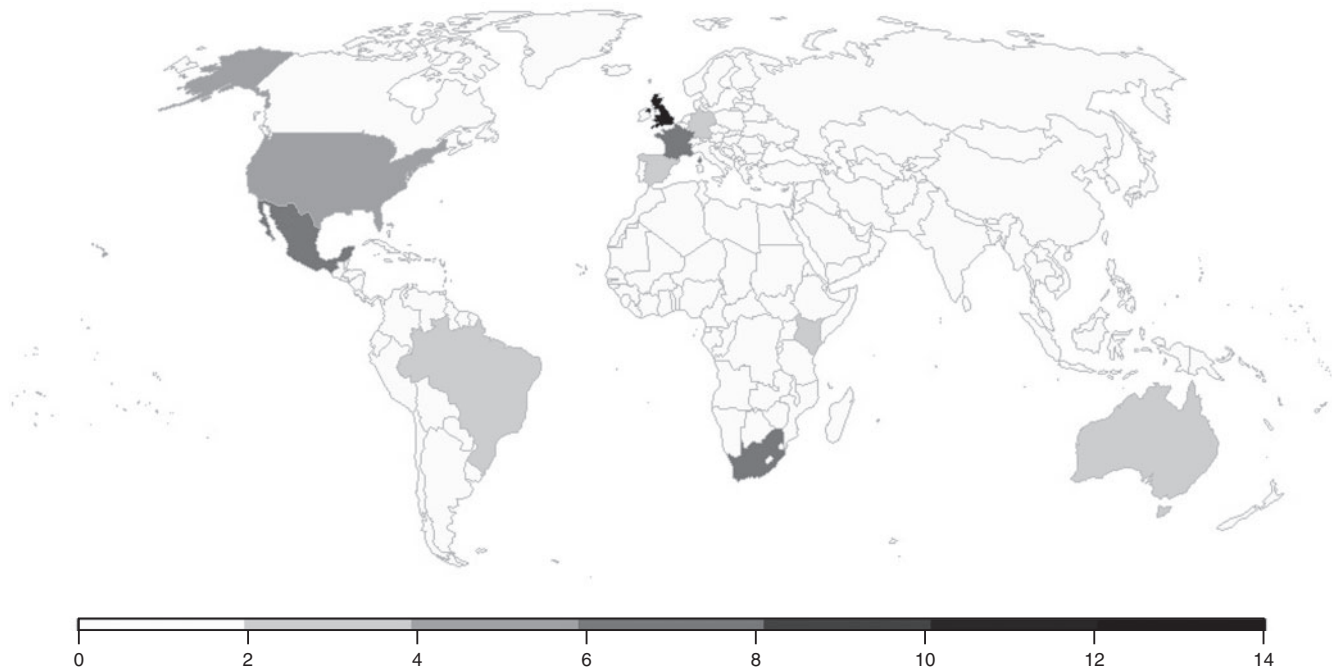
Fig. 2. Distribution of studies by authors' countries. The darker a country, the higher the number of authors assessing taxonomy.