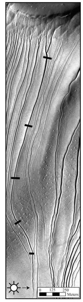
Figure 1 : Position of the five cross sections studied along the gully. HiRISE image PSP_007229_1255 on the left.

erosion rate over time with increase in fluid the concentration. Table 1). Less solid material is incorporated from upstream to downstream and it generates a decrease of the viscosity during the flow advance (which can explain a fall in the available erosive energy of the flow, Table 1 and 2). The fact that the flow is supersaturated in solid material is highlighted by the fact that an increase in the liquid flow discharge will increase the erosion rate (Table 1 and 2). The sedimentation rate is relatively constant over time (Table 2) and it is not easy to establish quantitative relation between the sedimentation and the others rate physical parameters of the flow. The evaporation rate seems unstable over time and rapidly varies (Table 2) probably in relation with the complex fluid stability conditions on Mars.