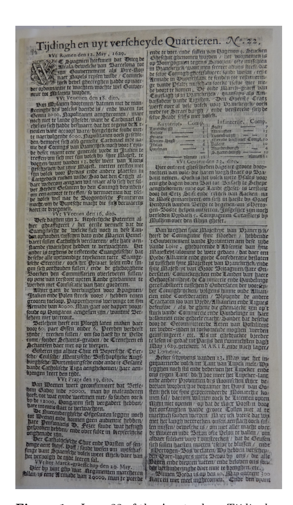
Figure 1 – Issue 22 of the Amsterdam Tijdinghen uyt verscheyde quartieren of 1629, one of the oldest Dutch newspapers.

By the middle of the seventeenth century the use of print for communicating (and explaining) new regulations was ubiquitous throughout Europe. Some state reg-