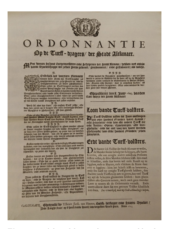
Figure 2 – A broadsheet ordinance issued by the magistrates of Alkmaar on 10 June 1643 on the peat trade in the city.

on oral proclamation reinforced by printed pamphlets. Others, like the Dutch Republic, made heavy use of both pamphlets and broadsheets, still following the ceremonial and judicially necessary public oral proclamation.<sup>14</sup>