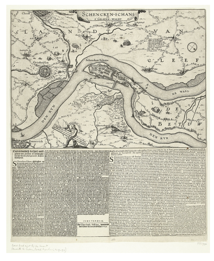
Figure 3 – An illustrated broadsheet by the Amsterdam publisherengraver Claes Jansz Visscher, depicting the Dutch fortress of Schenkenschans in 1635, after a surprise attack by Spanish forces. A textual account is offered in Dutch and French. Source: Rijksmuseum, Amsterdam.

The seventeenth century, in the resonant words of R.C. Bakhuizen van den Brink, was the era in which 'the Dutch took fame by storm'.<sup>34</sup> This was a society that had always lived from the sea, with a dominant role in the local fisheries and an increasingly important part to play in trans-European trade from the Baltic to the Mediterranean. In the sixteenth century the Dutch were among the many in northern Europe who followed the Spanish and Portuguese achievements in opening up new routes to the East Indies and Americas; their scholars and publishers carefully noted the implications of these discoveries for cartography.<sup>35</sup> It was inevitable, as the new state grew in wealth and confidence, that Dutch mariners and investors would wish first to emulate, and then to challenge the achievements of the Iberian nations. From the tri-