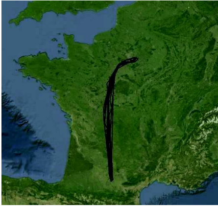
Figure 1: raw data on which the learning was made