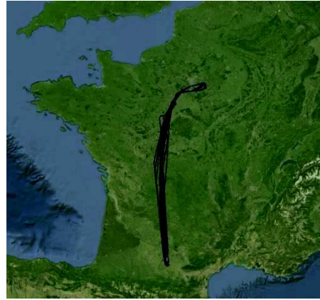
Figure 2: simulated trajectories

The amount of behavioral data we detected can be represented by the amount of situation vectors that we found and the amount of behavioral data actually learned can be represented by the number of aggregated points that we stored. On Figure 3 we can see that the number of situation vectors grows linearly with the number of aircraft in the simulation and that the number of aggregated point grows logarithmically and even stabilize at the end when the system learned all it could on the dataset. We stopped the graph at 30 aircrafts for readability but it is important to the number of situation vectors keep growing linearly and that the number of aggregated points stays constant.