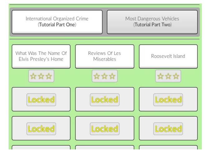
Fig. 1. Main screen of the game: the player has access to a few queries for which he can suggest reformulations. He has also access to the Tutorial part. Some queries are not accessible until the player gets a certain score.

Fig. 1 presents a typical display a player sees when connected. He can access the tutorial that explains what the goal of the game. The tutorial consists also in two examples with some suggestions for effective query reformulation. The tutorial part can be accessed without being logged in. As soon as the player makes some successful games, he gets a sufficient score to open lockers that give access to new queries and information needs to play with.