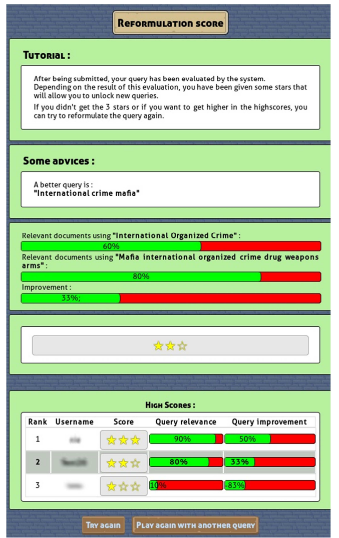
Fig. 2. Tutorial part of the game regarding query reformulation. Rule, information need, initial query, and a query reformulation suggested by the player.

Fig. 2 shows the tutorial part of the game. Both the query and the information need are displayed (the entire TREC topic composed of the title, description, and narrative when available). The user can then make a try for a new query associated with the information need (see bottom part of the screenshot Fig. 2).