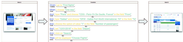
Fig. 1. State Machine representing a Scenario transition

other one resultant of the action were represented as States. Scenarios in the Transition state have always at least one or more Conditions (represented by the “Given” clause), one or more Events (represented by the “When” clause), and one or more Actions (represented by the “Then” clause). These elements always trigger instances of tasks that are represented as the Steps of Scenarios.