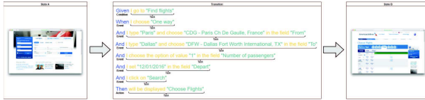
Fig. 1. State Machine representing a Scenario transition

other one resultant of the action were represented as States. Scenarios in the Transition state have always at least one or more Conditions (represented by the “Given” clause), one or more Events (represented by the “When” clause), and one or more Actions (represented by the “Then” clause). These elements always trigger instances of tasks that are represented as the Steps of Scenarios.