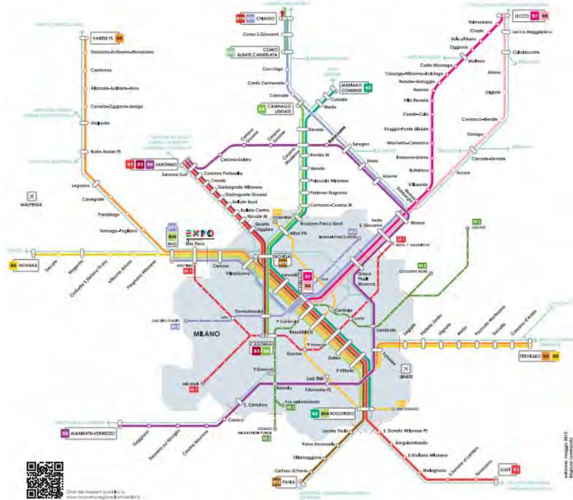
[fig. 3] The Milanese Servizio Ferroviario Suburbano's map.