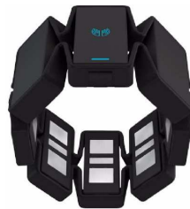
Figure 2: MYO armband by Thalmic Labs ® ([13])

To acquire sEMG signal, we used MYO ® armband developed by Thalmic Labs ® (fig. 2). This device integrates eight