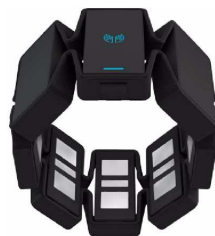
Figure 2: MYO armband by Thalmic Labs ® ([13])

To acquire sEMG signal, we used MYO ® armband developed by Thalmic Labs ® (fig. 2). This device integrates eight