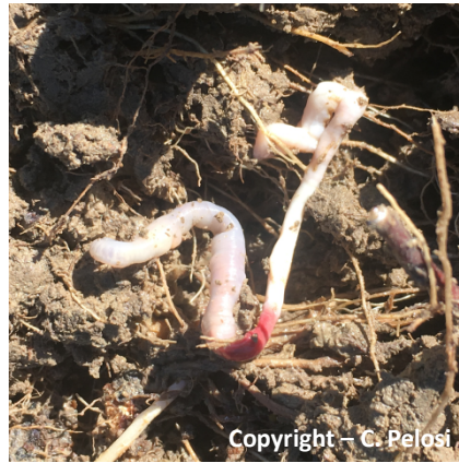
Fig. 4 Dead endogeic earthworm at the soil surface after the application of the Swing Gold® at ten times the recommended dose