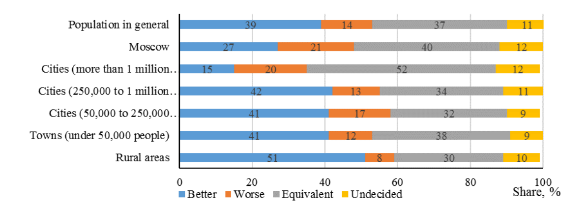
Figure 1. Attitude of Russian consumers towards the quality of food products of domestic and foreign production

When analyzing behavioural aspects of Russian consumers, it is important to touch upon the problem of their comparative attitude towards particular types of foreign-made and domestic food products. For example, the research undertaken by the Public Opinion Fund "Fond Obshchestvennoe Mnenie" (FOM, 2015) produced quite interesting results when comparing consumers' attitude towards the quality of food products of domestic and foreign production (Fig. 1). The study was held among Russian citizens above 18 years, 1500 respondents in total; in 104 populated localities situated in 53 subjects of the Russian Federation.