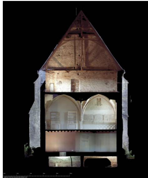
Figure 6. Section south of the kitchen

At the building scale, it's for example helpful to analyse the layout of the buttresses in the gallery of the cloister or on the refectory. The gutter walls of this last building were modified with different kinds of windows between east and west. With the same idea, sections on framework can help to understand the modification of the space, especially in the old kitchen at Cormery where the connections between the buildings of the cloister changed several times during the medieval period (Figure 6).