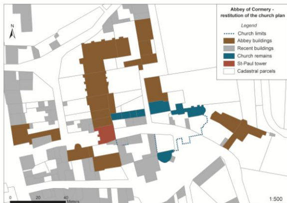
Figure 2. Map of the abbey of Cormery with the church limits

Within the PhD framework, the production of new surveys was necessary to work on the whole monastery, from the scale of the building to the scale of the stones. A special attention was given to St Paul tower which needed several kinds of survey to get a satisfactory result.