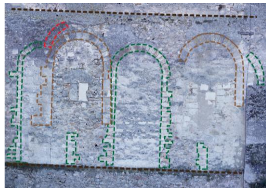
Figure 10 - Projections and plugged windows on the east face of St Paul tower.

Studying the orthophoto, we highlight a third architectural phase (in red on Figure 10), pictured by some arched stones at the left side of the wall.