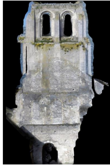
Figure 9. Orthoimage of the east face of St Paul tower

of a very small captor (GoPro HERO3+ Silver Edition), the very-close range enabled us to produce the best digital image (Figure 9).