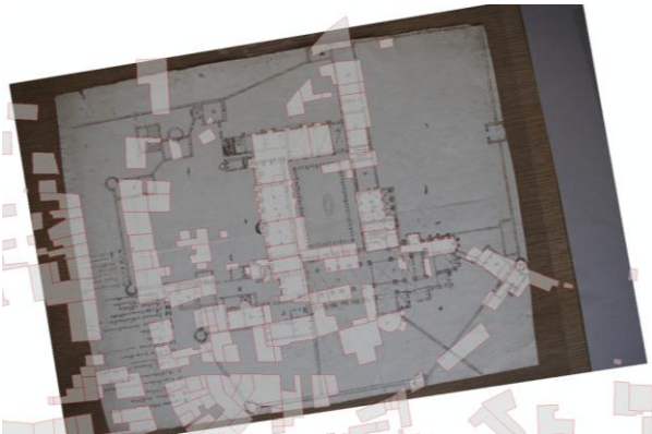
Figure 4. Map of the abbey of Cormery produced in 1674

Using GIS gives us the possibility to compare the existing remains with the location of buildings in the plans and maps created between the 17 th and the 19 th century. For example, the georeferenced map of the figure 4 dates back to 1674 (Paris, Archives nationales, CPNIII_Indre-et-Loire), when St Maur Congregation tried to renovate monastic life by modifying the spatial organization of the monastery.