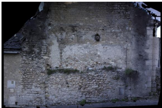
Figure 8. Orthoimage of the west wall of the north transept church

Photogrammetry was also used to work on the wall built with small stones apparatus which needs a very good precision for stone by stone drawing. These kinds of walls are usually attributed to the 11 th century, but they could also have been constructed during the 10 th century because this building method was used all along the early Middle Ages (Prigent, 2012).