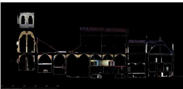
Figure 5. Section north-south with tower, refectory and kitchen

There are used at the scale of the abbey to understand the difference of levels between the buildings of the monastery, especially for understanding of the gap between the ground level of the refectory, the cloister and the church.