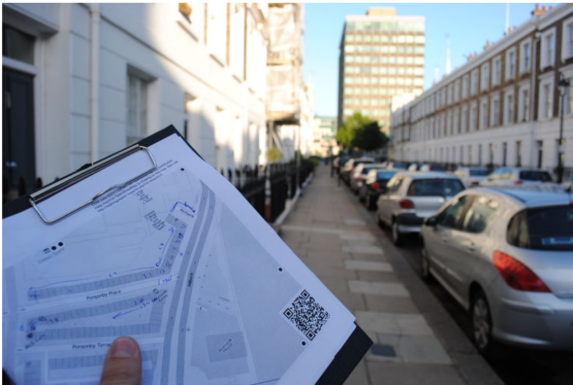
Figure 2 – Walking paper.

To understand the lack of mobilization of the volunteers, it is important to have a clearer idea of what kind of an activity mapping is. OSM is generally presented as a platform where everyone, once registered, should be able to contribute. To take part in drawing the map, one does not need expensive tools: the basic process is to print the area to be mapped on “walking papers” (figure 2) and start listing the items lacking in the public space, whether those items would be buildings and roads, or traffic lights, trees and pedestrian crossings. To help her in her task, one could use a GPS or smartphone, to record geographical position and take pictures of the area.