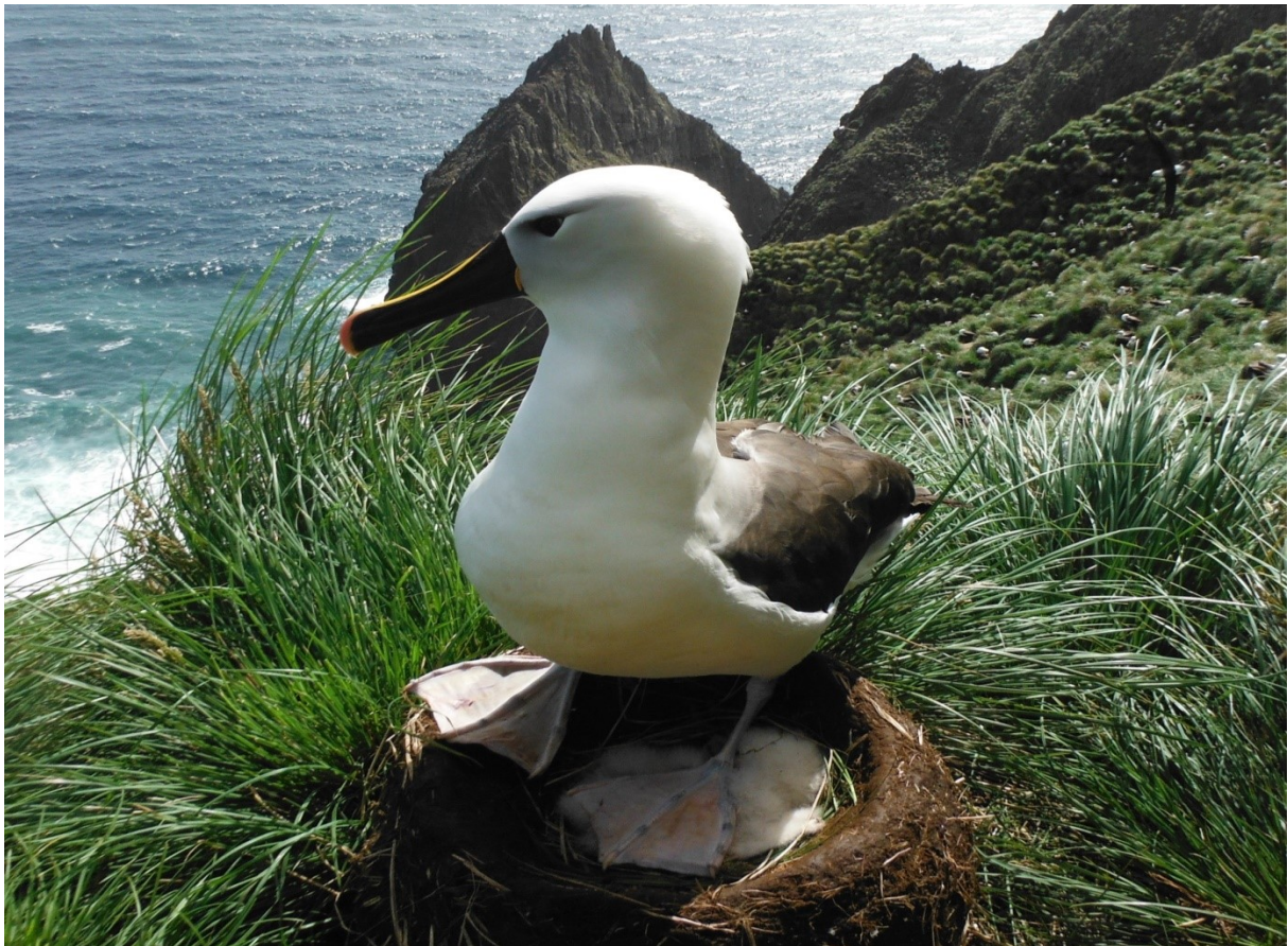
Fig. 1. Adult Indian yellow-nosed albatross over dead chick at the Entrecasteaux cliffs on Amsterdam Island (37.8°S, 77.6°E) where recurrent massive chick mortality events have been occurring.