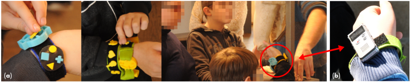
Figure 3. (a) The first version of the probe is non interactive. Children used it to built tactile bracelets and generate novel scenarios for documenting and reflecting on field-trips (here, in a museum). (b) The second version is a functional bracelet recording and playing sound.

for the recordings to "show" it to one of his friend. Which confirms teachers' perceptions that an approach including non-visual material indeed enables these children to share with their sighted peers.