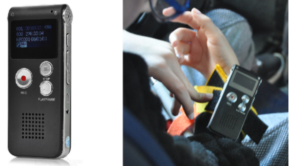
Figure 2. The second version of the probe is worn on the wrist. It consists of a strap covered with velcro on which an audio recorder/player.

Version 2. However, it was quite difficult to follow each child, which frustrated them—and this approach was unsustainable for