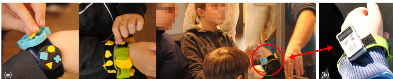
Figure 3. (a) The first version of the probe is non interactive. Children used it to built tactile bracelets and generate novel scenarios for documenting and reflecting on field-trips (here, in a museum). (b) The second version is a functional bracelet recording and playing sound.

for the recordings to “show” it to one of his friend. Which confirms teachers’ perceptions that an approach including non-visual material indeed enables these children to share with their sighted peers.