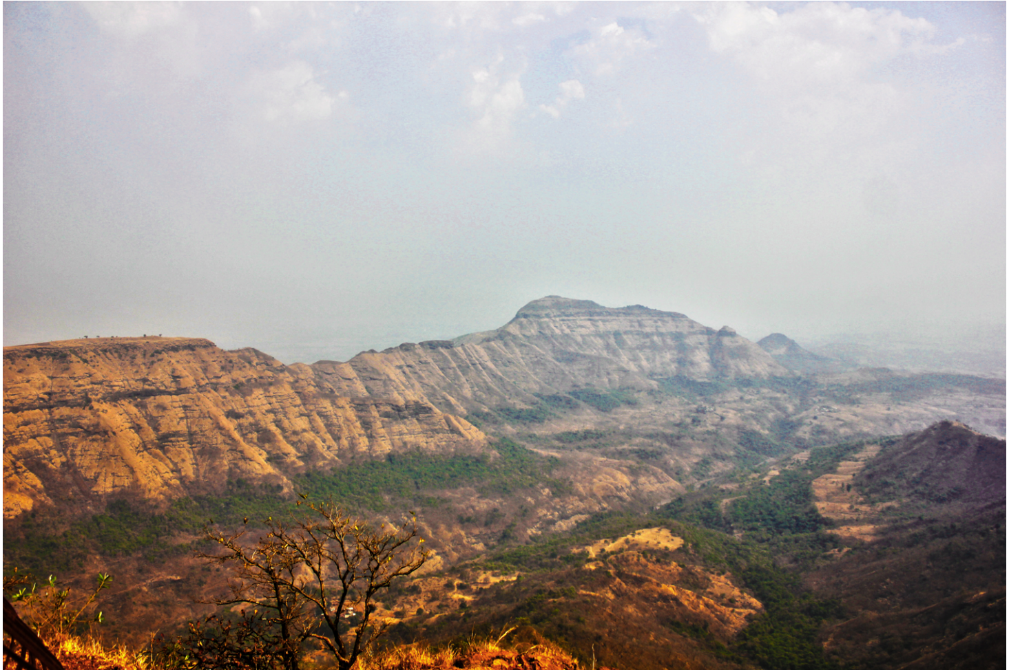
Fig. 3. Southern ridge of the c. 1000 m high Matheran Plateau showing sub-horizontal to gently dipping flows of the Deccan large igneous province. View looking towards the south; Photograph by Achyuta Ayan Misra.