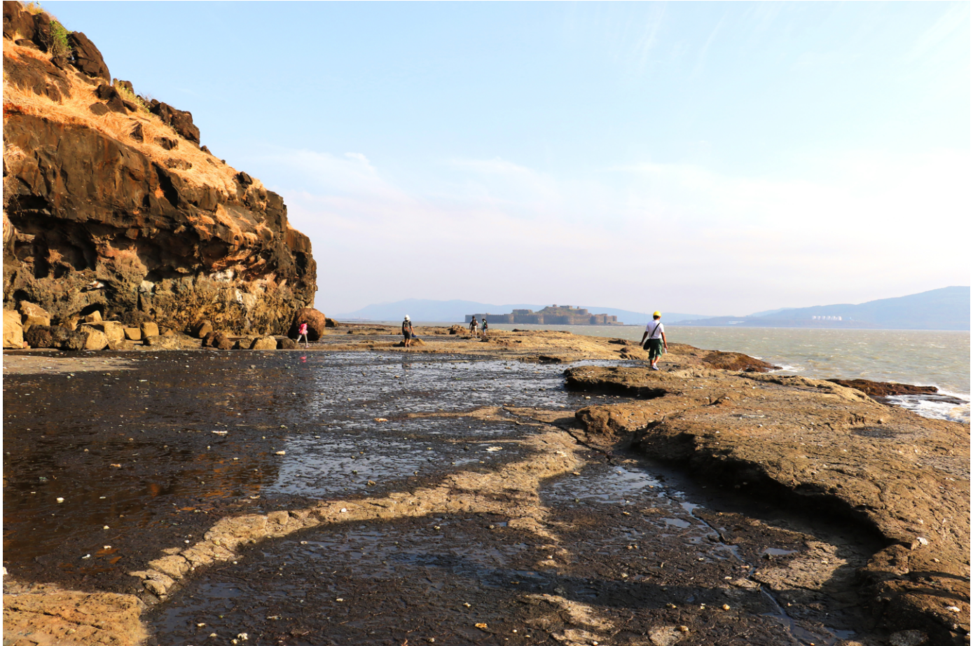
Fig. 4. A typical wave-cut platform at Janjira-Murud c. 140 km south of Mumbai along the west coast of India. This view looking towards the south shows the hilly terrain around the area and the Janjira sea fort in the background. Such sub-horizontal exposures along rocky stretches provide a wealth of geological knowledge on the tectonics of the Deccan large igneous province (e.g. Dessai & Bertrand 1995; Hooper et al. 2010; Misra et al. 2014; Misra & Mukherjee 2016 ).