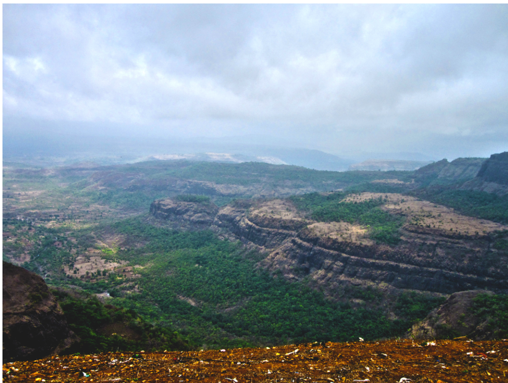
Fig. 2. View of sub-horizontal lava flows of the Deccan large igneous province looking towards the west from Lion Point in Lonavala, c. 100 km east of Mumbai. This location is on the top of the Western Ghat Escarpment; Photograph by Achyuta Ayan Misra.

Misra et al. (2016) studied carbonate seismic facies and subsidence on the ridges in the NW Arabian Sea to analyse how the Deccan mantle plume affected the tectonics of the offshore region of the DLIP. Gupta et al. (2016) detail seismicity based on several geophysical techniques in the Koyna region, where the periodic loading and unloading of water has been envisaged for seismicity induced by artificial water reservoirs since 1967. Their preliminary borehole investigations revealed faults and foliation planes and more detail is expected from this research group in the coming years regarding subsurface structural geology at Koyna. Analyses of P-wave receiver functions by Mandal (2016) enabled him to delineate the crust–mantle structure below the Kutch rift zone. He attributed this complex structure to be a key causative factor of the recent lower crustal seismicity in the region. Rajaram et al. (2016) performed detailed magnetic studies on part of the Deccan Traps and identified seven subsurface lineaments. They correlated these lineaments in the magnetic anomalies with already known brittle shear zones, faults and river