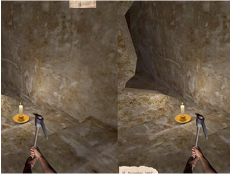
Figure 4: A screen shot of the “King Tut VR2” (Copyright ©, EON Reality, Inc) application in the HMD Mobile device

3.2.4 Task. The experiment consists of the use of the edutainment “King Tut VR2” application designed by the EON Reality SAS company. The goal of the “King Tut VR2” VE application (see Fig. 4) is to relive the journey of Howard Carter and his discovery of King Tutankhamun’s tomb. The participants were asked to follow the instructions given by the voice-over in the VR application. The tasks covered passive activity (i.e., watching and listening to Howard Carter’s journey) and active activity (i.e., excavating with a pickaxe in the ground).