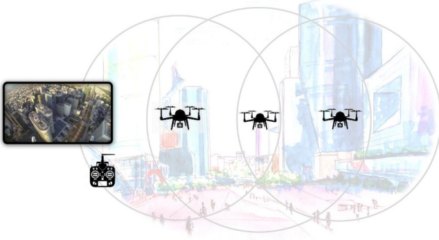
Fig. 1. A proposed ad hoc scenario with a basic line formation

By using our proposal, if the leader L is moved further (to capture a video of a very distant area, for instance), a first follower F_1 will automatically take off and position itself between the operator and the leader to relay the control commands, status information and video in real-time. If the leader goes still further (also moving F_1 ), a second follower F_2 will do the same, positioning itself between the operator and F_1 , and so on. Conversely, when the leader returns to the operator, the last drone that has taken off automatically will land if the signal quality is sufficient with the drone ahead. The prototype currently developed allows up to four followers with real time video streaming from the leader to the operator. Figure 1 shows a remote control with a screen (on the left) to command the drone leader (on the right) and view the captured real-time video from its camera. The distance between the command center and the leader being too long, a first follower, then a second one, automatically took off to ensure good video quality (depending on the requirement of the application).