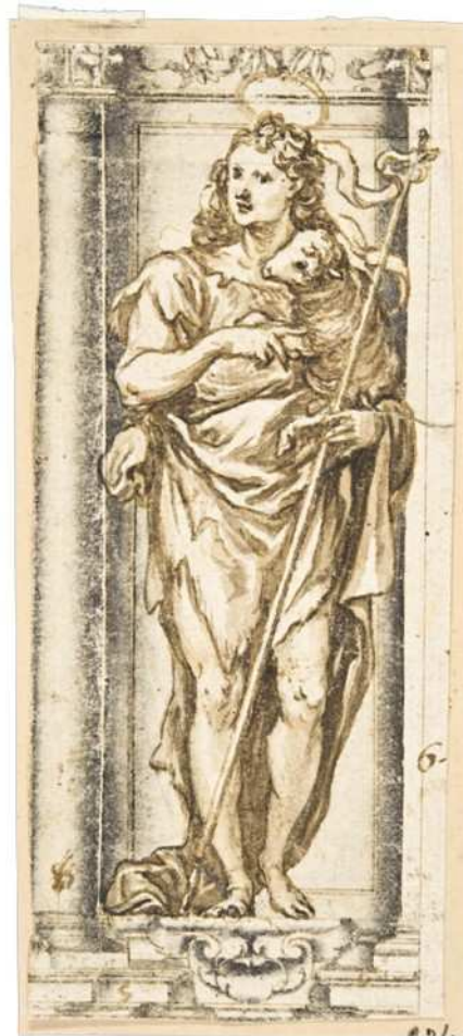
5 Francisco Rizi, St John the Baptist , ca. 1654, pen and brown ink, brown and grey wash on paper, 146 x 62 mm. Biblioteca Nacional de España, Madrid