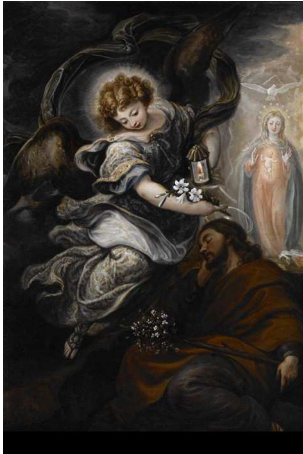
3 Francisco Rizi, The dream of S. Joseph , ca. 1670-75, oil on canvas, 166 x 114 mm, signed: "RICI PICT REGI". Indianapolis Museum of Art, Indianapolis (reprod. from: Kasl, Sacred Spain , 196)

Expectant Virgin and counted the royal family and prominent aristocrats among its members 21 .