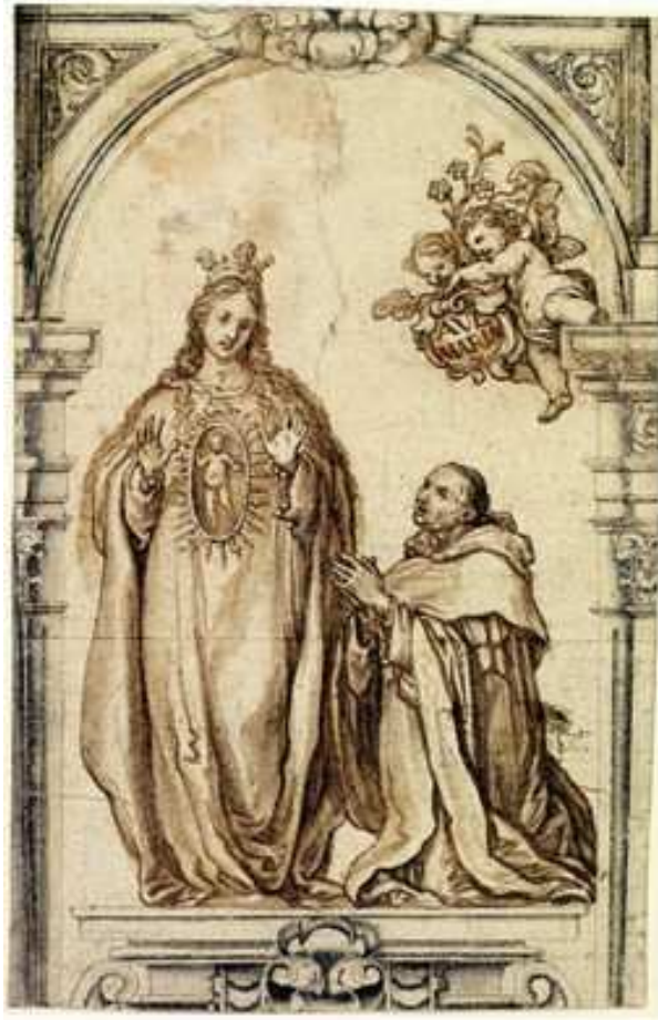
1 Francisco Rizi, Our Lady of the Expectation appearing to Simon de Rojas , ca. 1654, pen and brown ink, brown and grey wash on paper, 196 x 125 mm. British Museum, London (reprod. from: M.P. McDonald, Renaissance to Goya , 98)

painter, usually not even mentioned in the contract, who designed the entire altarpiece, including sculpture models and ornamental designs 6 . Among the draughtsmen who must have often worked in partnership with sculptors is Francisco Rizi (1614-1685), a painter whose drawings include several examples of designs for altarpieces and other decorative projects, for which he must have collaborated with other painters, architects and sculptors 7 .