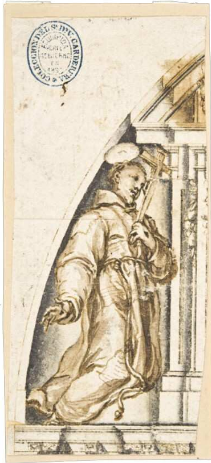
6 Francisco Rizi, St Francis , ca. 1654, pen and brown ink, brown and grey wash on paper, 143 x 62 mm. Biblioteca Nacional de España, Madrid