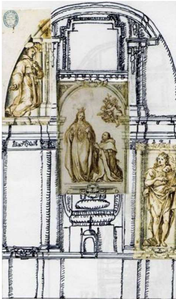
7 Francisco Rizi, Design drawing of the altarpiece of Our Lady of the Expectation , ideal reconstruction (© Author)