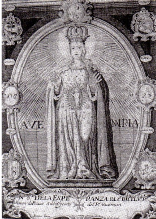
4 Juan Pérez, Our Lady of the Expectation , 1739, engraving, 205 x 150 mm. Biblioteca Nacional de España, Madrid (reprod. from: del Corral, La Congregación del Ave María , 36)