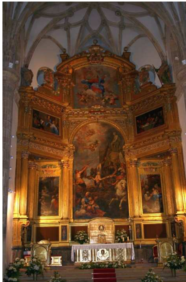
8 José de la Torre and Francisco Rizi, Altarpiece of St Peter, 1655. Iglesia de San Pedro, Fuente el Saz del Jarama