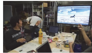
(b) Criticize and improve