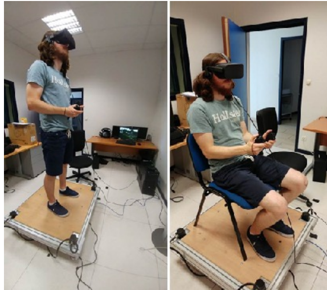
Figure 3. Walking simulation on left / Driving simulation on right.