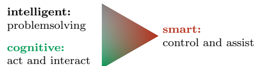
Fig. 2 Contrast of aims for three AI flavours.