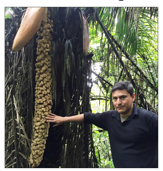
Figure 1. The male inflorescence of endemic ivory palm (Phytelephas aequatorialis). The orange material at the top of the image is the remnants of the bud integument.

We wanted to know whether heat is produced by the flowers and/or by the bud. Heat-producing plants usually warm up at the flowering stage (Seymour and Schultze-Motel 1997), so in February and June 2015, we travelled to