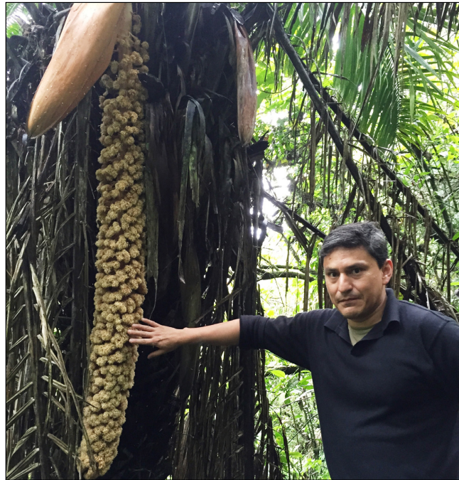
Figure 1. The male inflorescence of endemic ivory palm ( Phytelephas aequatorialis ). The orange material at the top of the image is the remnants of the bud integument.

We wanted to know whether heat is produced by the flowers and/or by the bud. Heat-producing plants usually warm up at the flowering stage (Seymour and Schultze-Motel 1997), so in February and June 2015, we travelled to