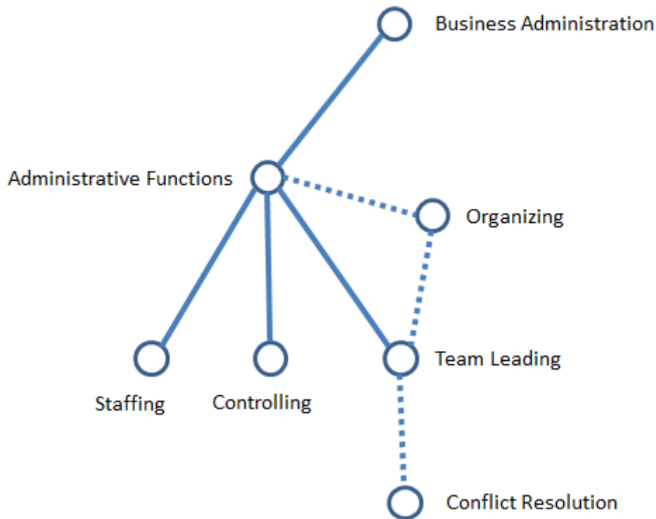
Figure 3. Example of consistent enrichment of a lattice that represents features for modeling industrial knowledge

Figure 3 shows an example of an admissible enrichment for a HR-Knowledge Base. Let us suppose that we have initially a set of concepts and relationships between them representing some knowledge about the Business Administration field. Completing Administrative Functions is part of this field, and Staffing, Controlling and Team Leading are also some kinds of Administrative Functions. Now, the system realizes that many candidates from the applicant's database are including Organizing as a competency. In that case, it is necessary to reorganize the knowledge base to place in successfully this new concept. The algorithms should be able to detect that Organizing is a superior concept of Team Leading (since it probably includes other many aspects such as Team Creation, Training, and so on). Therefore this approach has to be able to automatically reorganize this part of our HR-Knowledge Base accordingly.