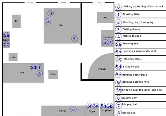
Figure 1: One day of the notes the participant took showing the order of locations he visited during his morning routine.

that a commercial service robot that will be deployed on the consumer market will use rather low cost components in order to be affordable for a wide range of people. Thus our dataset reflects a realistic impression about how such a robot would perceive routine activities of its user when it is deployed in a human apartment. The dataset has been released to the public on September 24th, 2013 and is publicly available for download 1 .