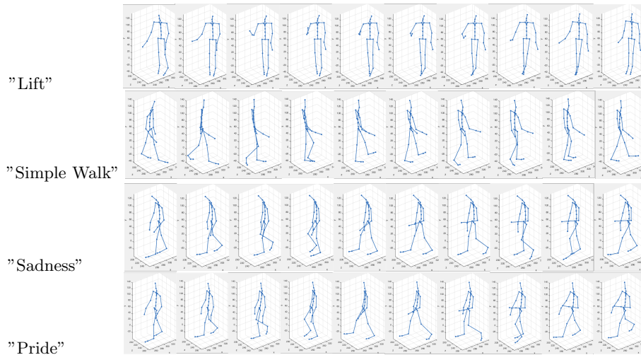
Fig. 2: Examples of generated motion from activity-conditioned (“Lift”, “Simple Walk”) and from emotion-conditioned SAAE (“Sadness”, “Pride”)

animations, with a conditional variant enabling synthesizing new sequences with a high level of monitoring.