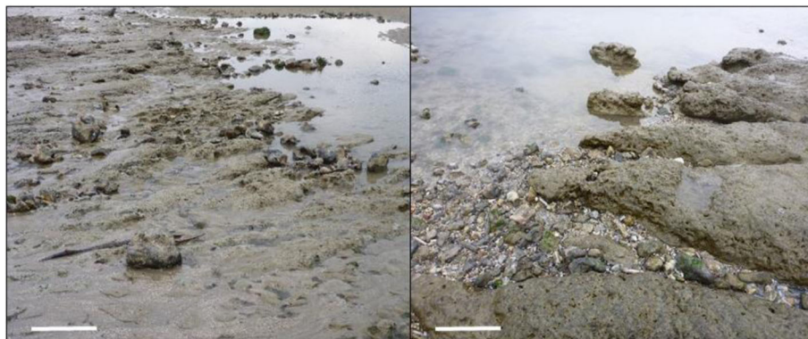
Fig. 2 Sampling site of Perisesarma alberti (scale bar: 0.3 m)

short teeth; chelar dactylus with 30 low and transversely elongated tubercles on the dorsal surface. Ambulatory legs relatively short and broad. Pleon broad, evenly rounded. Gonopore positioned in the depression on anterior edge of sternite 5, slightly touching the posterior margin of sternite 4, with an elongated operculum almost parallel to sternal sutures and a small sternal cover on the anterolateral corner of the operculum (Fig. 3).