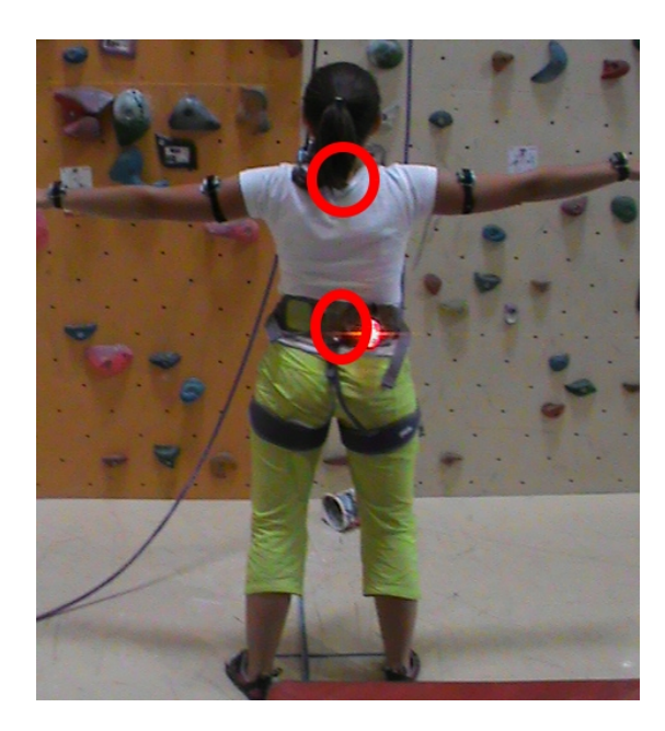
FIGURE 1 – Sensors attached to a climber. Only the ones circled in red are used in this article.

data by translating the time serie in classic covariance computation. The main interest now is that the time series x_t and y_t are now both in the same tangent space T_ISO(3) . They can therefore be compared.