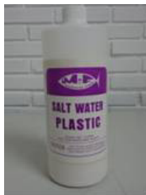
Fig. 1. A bottle of PVC-P.