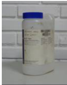
Fig. 2. Agar powder.