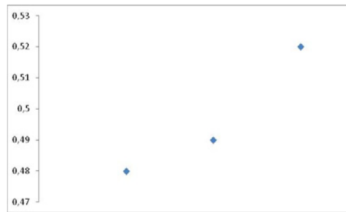
Fig. 5. Increase of thermal conductivity with concentration of NaCl. From left to right: pure, 100 g/l and 200 g/l of NaCl.