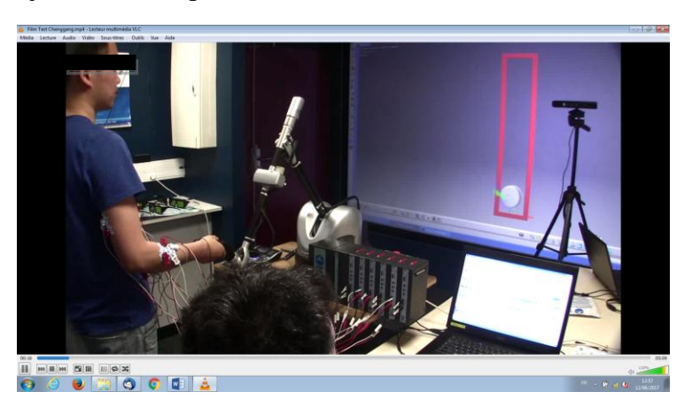
Figure é. Virtual reality environment setting

The task was divided into two sub tasks in order to discriminate which one induces more muscle fatigue. The first 2.5 minutes period of vertical movements represents the task 1 ( T1 ). The total 5 minutes period of the whole movement represents the task 2 ( T2 ). Note, that T1 and T2 consist in the same repetitive bottom up and up down movement. In order to evaluate the muscle fatigue level on the subject forearm, subjects had to perform a maximum voluntary contraction (MVC) task before and after the test. The EMG signals on extensor carpi radialis (ECR), flexor carpi radialis (FCR), biceps and triceps were recorded during