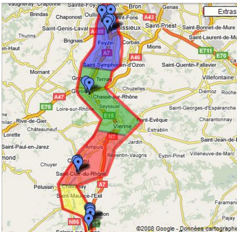
Figure 1: Distribution map of the 16 industrial sites in the study area.

The systematic inventory of company material and energy flows was conducted on each site with the agreement and support of the management teams (Site Director, Head of Environmental Management), during facility visits. The review guide contains thirty items concerning each relevant category of flows for a comprehensive review. Data collected over 3 successive years was then compared and supplemented with public data reported annually to public authorities (DRIRE).