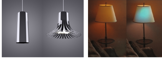
(a) Flower Lamp [1], using a shape-changing artefact. (b) Energy Local Lamp [14], using a color-changing artefact.