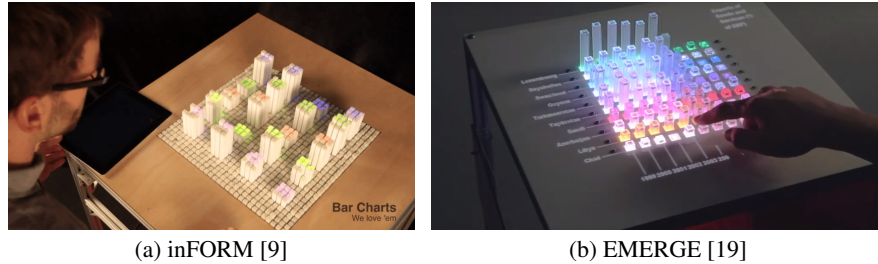
Figure 3: Two dynamic physical bar charts.

25.9% and 33.2% of UE overall energy demand against 25% for households [6].