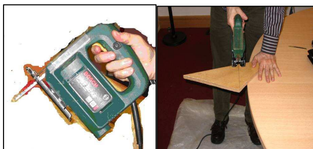
Figure 2: Saw Service Experiments