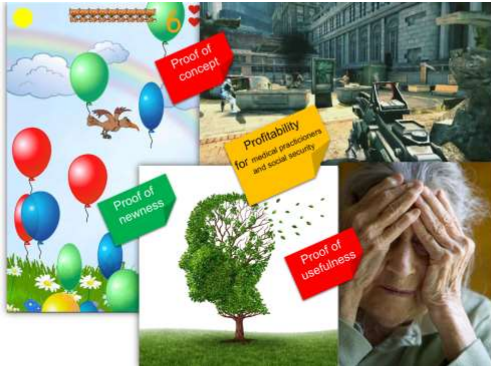
Figure 5. UNPC proofs for the Alzheimer-First-Person-Shooting project