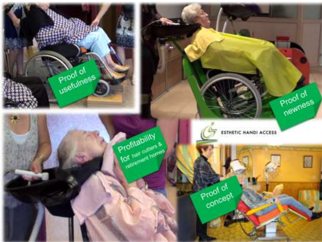
Figure 3. UNPC proofs for the hairdressing chair and furniture for elderly

hair dressing elderly people at geriatric hospitals, retirement homes or at home. For many elderly people, body motions are limited – for instance neck movement – and they are often wheelchair-bound. Consequently, washing their hair can be quite painful, and hairdressing takes more time due to transfer and installation times. One direct result is that on average three fewer clients can be seen in a day. The engineer came to the innovation jury with videos taken by his wife, movies of the prototypes he built in his garage (see Figure 3) and testimonies of elderly clients in conventional and novel hairdressing chairs. As he was convincing (proofs of usefulness and proofs of concept ), he patented his inventions (proof of newness ) and the market was apparently huge (proof of profitability ), he was not only selected by Silver Valley but also incubated for one year. He created a company called Esthetic Handi Access ( http://www.esthetic-handi-access.com/fr/ ) that started industrial production with a full order book, because he was now able to prove that hairdressers of the elderly have the same number of clients per day than any other hairdresser (proof of profitability ).