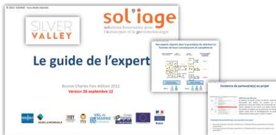
Figure 8. Detailed chart of 22 pieces of evidence of usefulness, newness, profitability and concept proposed

Third, the French automotive supplier Valeo, has recently decided to adopt the UNPC model as the backbone of his internal innovation project selection, as well as the basis of the outer filtering process of interesting high-tech startups (in an open innovation strategy). Of course, they are completing the 4 UNPC indicators, which only express value creation for users, with indicators expressing the strategy alignment with the company and the skills and know-how compatibility.