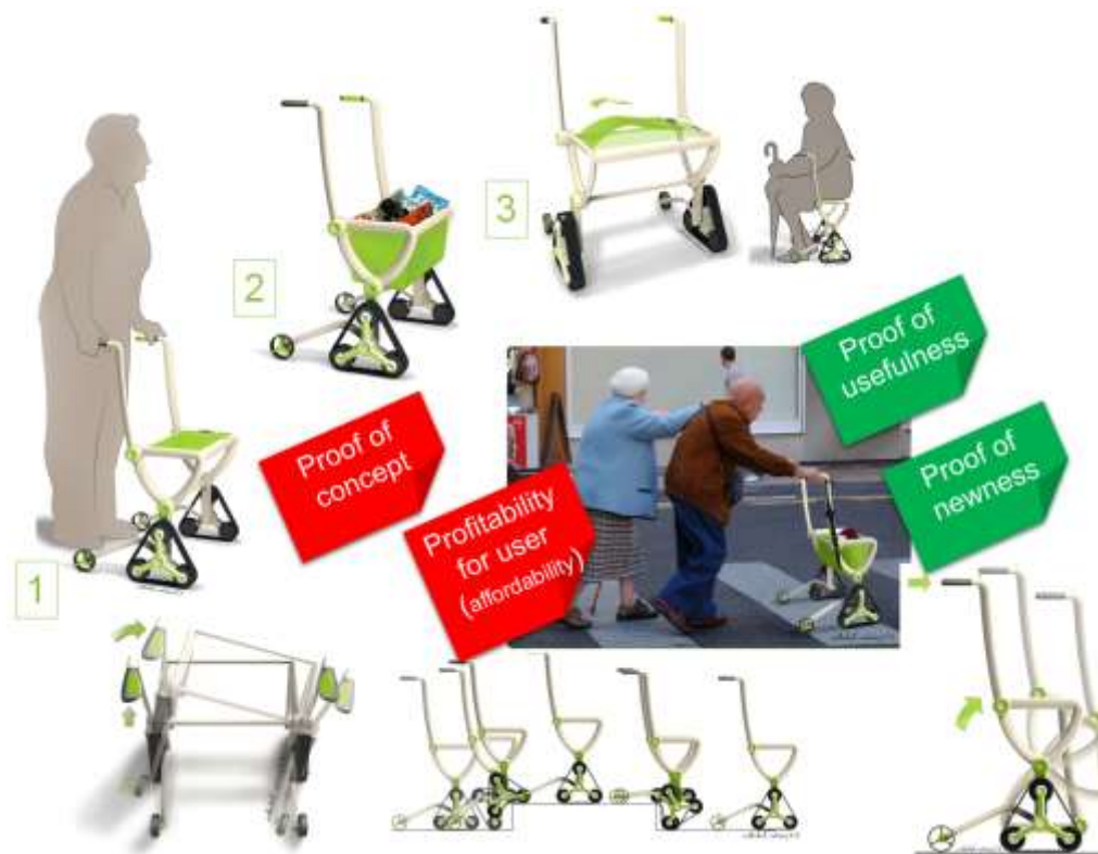
Figure 4. UNPC proofs for the walking frame project

concept . The project was not selected by Silver Valley and the entrepreneur abandoned the project two years later.