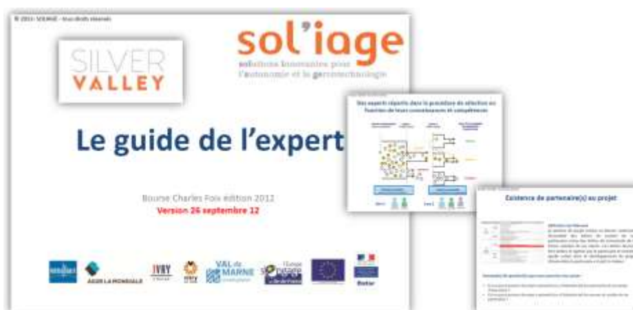
Figure 8. Detailed chart of 22 pieces of evidence of usefulness, newness, profitability and concept proposed

Third, the French automotive supplier Valeo, has recently decided to adopt the UNPC model as the backbone of his internal innovation project selection, as well as the basis of the outer filtering process of interesting high-tech startups (in an open innovation strategy). Of course, they are completing the 4 UNPC indicators, which only express value creation for users, with indicators expressing the strategy alignment with the company and the skills and know-how compatibility.