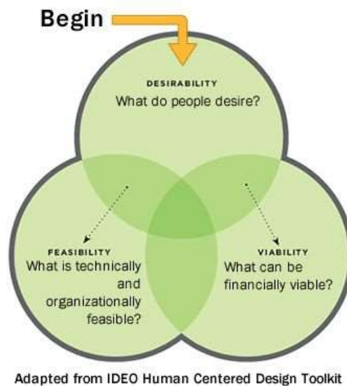
Figure 1. The IDEO innovativeness set of indicators made of desirability, feasibility and viability

We have therefore seen that there are different notions of usefulness , feasibility , newness ( design/apparent and technical ) or novelty , profitability , desirability , viability , wow effect and emotional impact . Apart the IDEO tryptic, there have been few attempts to propose a whole set of innovativeness metrics. This is due to the diversity of innovation situations and realities that condition innovation success in the context of an entrepreneurial or intrapreneurial venture.