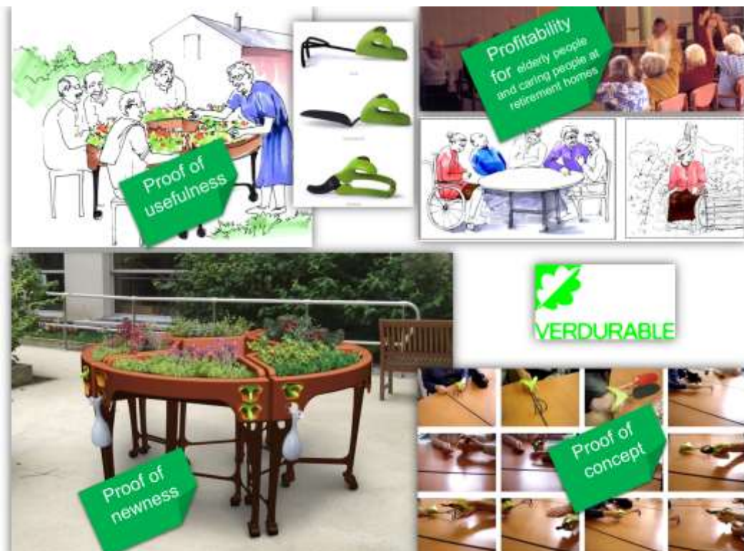
Figure 2. UNPC proofs for the gardening table project

The second example is an innovative hairdressing chair and furniture for elderly proposed by an experienced engineer. During a period of unemployment, he heard his wife complaining when she was