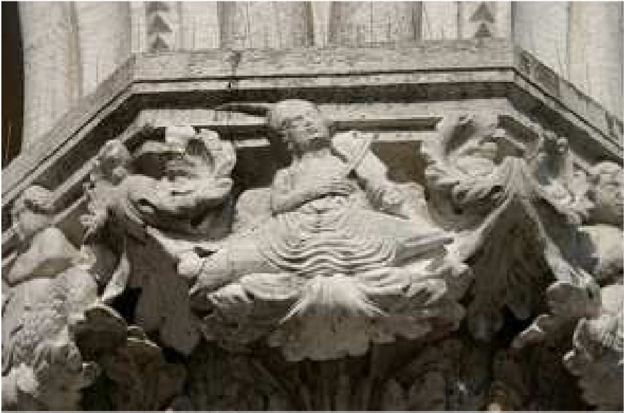
Figure 2: Arion playing a medieval lyre, Venice, Ducal Palace, Capital 31 in the porch

1325, illustrate a lyre player (see Figure 1) at Herod’s banquet, a common iconographical theme in medieval art. 23 The presence of the medieval lyre and musician’s dress demonstrates that Giotto took inspiration from his surroundings, giving a contemporary look to ancient themes – common practice throughout the history of art. 24 Moreover, according to Pompeo Molmenti, two sculptures on the 31 st capital of the façade of the Ducal Palace in Venice, dating back to the end of the 1300s, allude to this kind of outdoor entertainment; they show Arion with a medieval lyre, riding a dolphin, and another musician with a lute (see Figure 2). 25