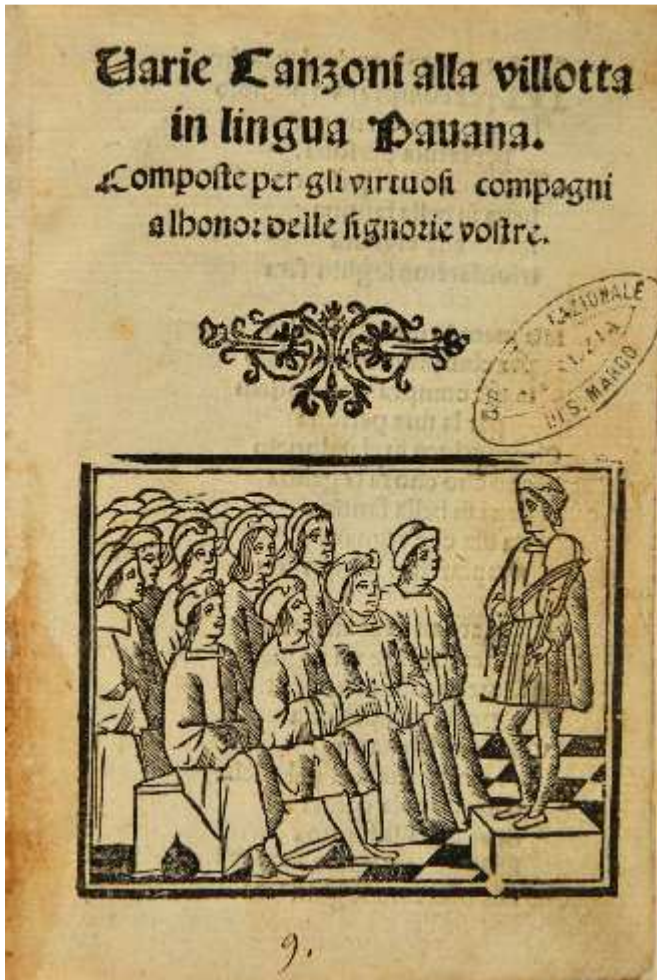
Figure 4: Varie canzoni alla villotta in lingua pauana. Composte per gli virtuosi compagni al honor delle signorie vostre , s. l., 16th century, Venice, Biblioteca nazionale Marciana, MISC 2213.09, Frontispiece

chiamar di Tyro” (“I call myself Apollonius of Tyre”), which explains why he is dressed “all’antica”, as Apollonius was supposed to be from the Classical era. Of very similar conception is the frontispiece to the pamphlet Varie canzoni alla villotta in lingua pauana. Composte per gli virtuosi compagni al honor delle signorie vostre (see Figure 4). The print has only four folios and contains suggestive erotic poems in the Paduan dialect, as well as a rhyme by the famous Ferrarese poet Antonio Tebaldeo (fol. 4 r ), and the image on the first page again represents