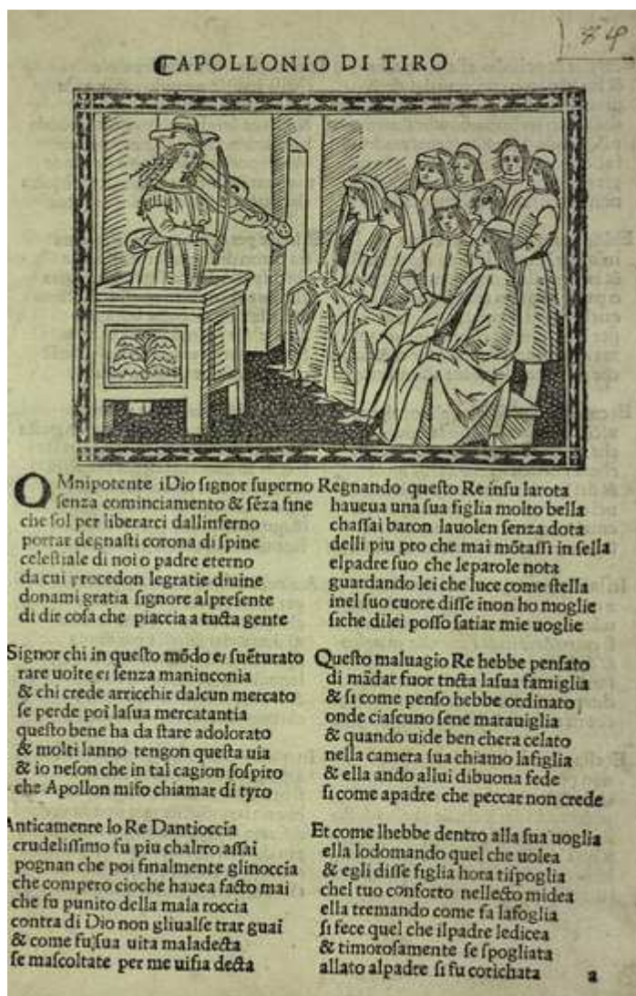
Figure 3: Historia Apollonii regis Tyri , translated into Italian by Antonio Pucci. Florence: Bartolomeo de' Libri, 1498, Venice, Fondazione Giorgio Cini, FOAN TES 838

Tyri (see Figure 3), for instance, shows a man dressed in Classical garb standing on a platform and playing a lira da braccio before a group of elegantly dressed men, some sitting and some standing. The last verse of the second ottava rima says that the man playing the lyre is also the author of the poem: “Apollon mi fo