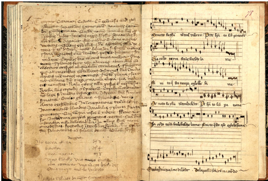
Figures 5 and 6: Siena, Biblioteca Comunale degli Intronati, ms. L.XI.41, fols. 4v-5r and 77v-78r