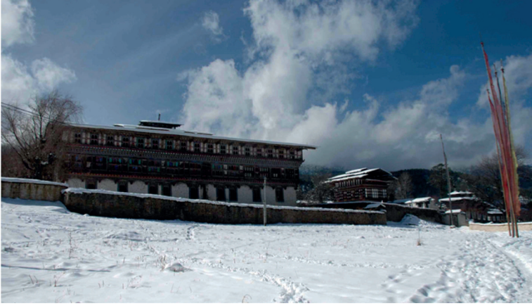
Wangdu Choling Palace east side and the Lingkana temple in winter