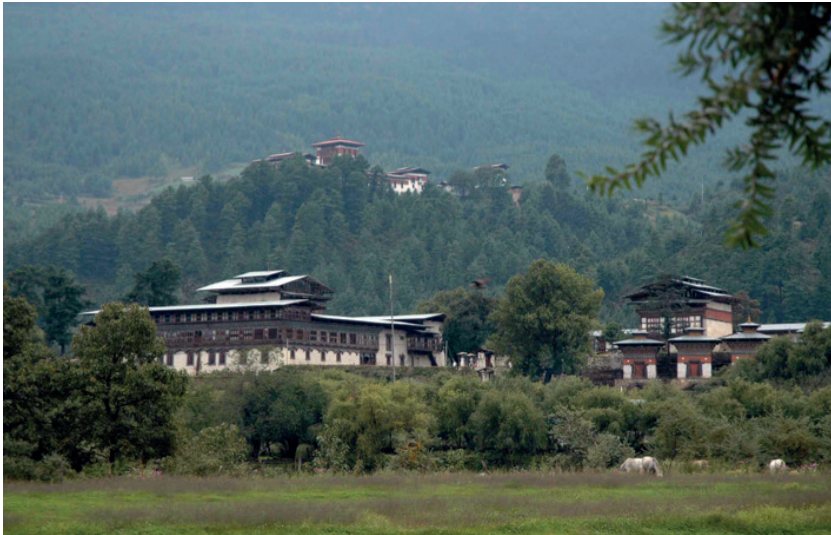
Wangdu Choling Place north and eastern sides and the Lingkana temple, the prayer wheels and the Jakar Dzong in the background