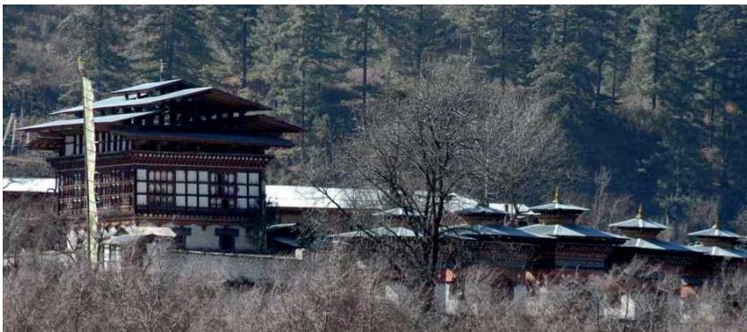
Lingkana Temple and water prayer-wheels south side