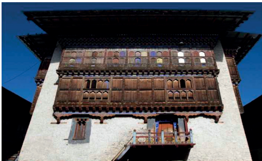
The Central tower (Utse) and window ( rabsel )