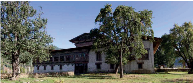
Wangdu Choling Palace north side