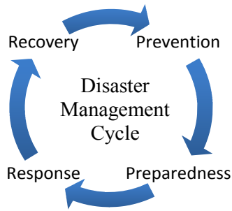
Fig. 2. Phases of disaster management cycle

Disaster management is defined as ‘the integration of all activities required to build, sustain and improve the capabilities to prepare for, respond to, recover from, or mitigate against a disaster’[12]. These four activities focus on risk management (prevention, preparedness) and crisis management (response and recovery) comprise the disaster management cycle as mentioned in Figure 2 [13]. These activities are not independent and sequential; indeed response and recovery phases initiate instantaneously, whereas populations have different long-term or short-term recovery operations can go on for days to months. Moreover, public health and economic recovery processes can take years or beyond that. The ultimate success of response and recovery activities are influenced by the data collected during the preparedness and prevention phases.